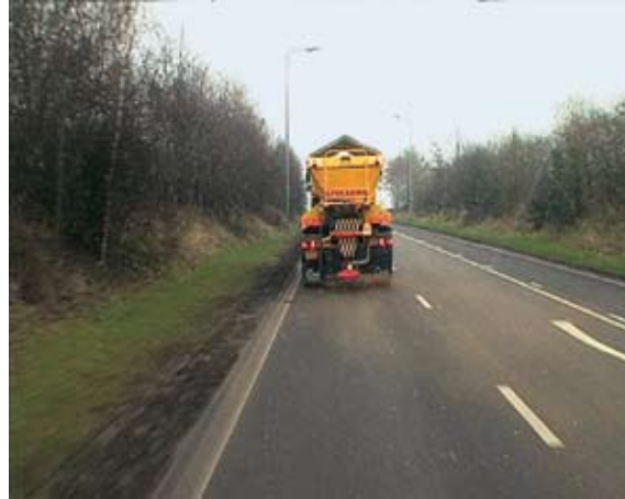
Thawrox stays where it's spread, reducing the amount of product needed to clear the roads.