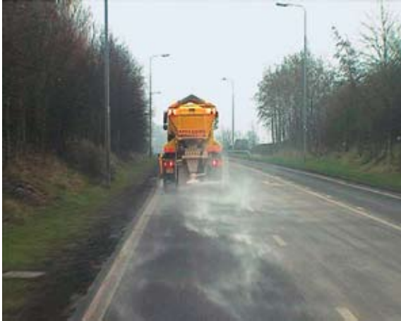
Traditional rock salt bounces around and flies off the road with wind and traffic movement.

Thanks to its efficiency and significant operational cost savings, Thawrox™ is the future of deicing. Thawrox is produced by Sifto Canada Corp., (a Compass Minerals Company), one of the largest basic producers of salt in the world and an expert in the salt industry, so you can be sure you'll get exceptional customer service.